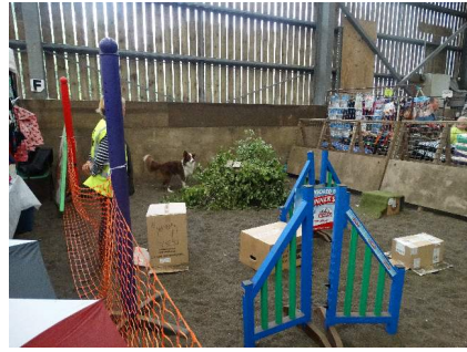
Have-a-go Rally O